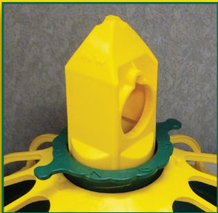
Also available - the single piece tower provides additional rigidity and strength especially when feeding larger birds