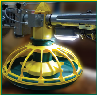
The LED light will attract your birds to the pans when it's feeding time.