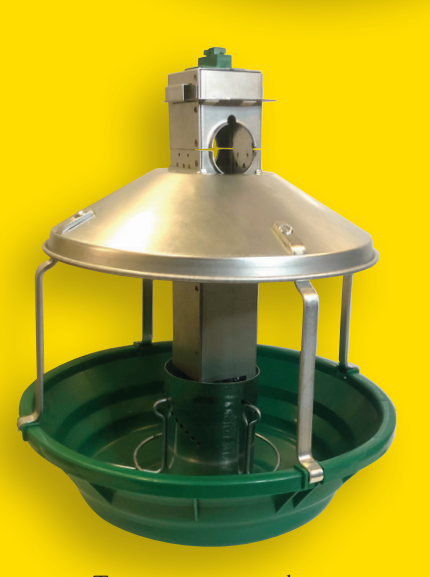
Two-piece tower makes maintenance much easier!