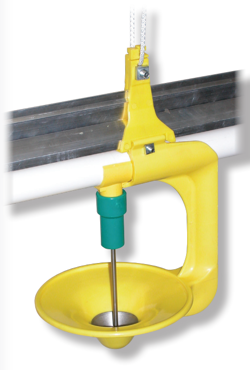
Available in both aluminum channel and conduit line support.

VAL-CO Turkey Watering can help you raise cleaner and healthier turkeys.